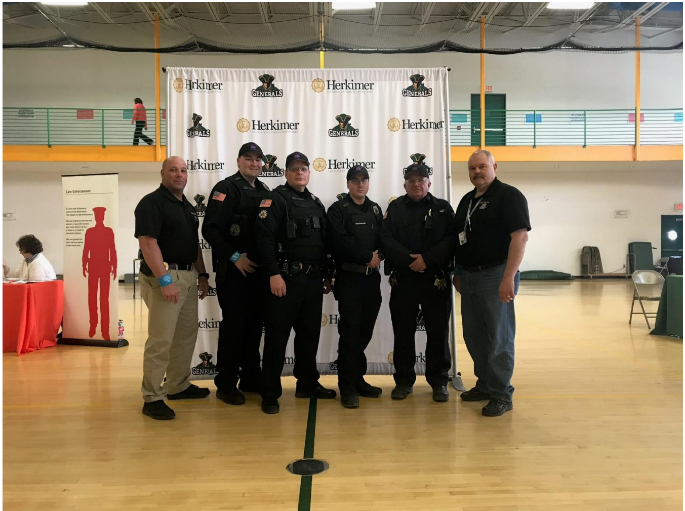
Above Campus Safety Participants in the One Love Yards for Yearley

Both the accuser and the accused will be informed of the outcome of any institutional disciplinary proceeding that is brought alleging a sex offense. Compliance with this paragraph does not constitute a violation of the Family Educational Rights and Privacy Act (FERPA) . For the purpose of this paragraph, the outcome of a disciplinary proceeding means only the institution's final determination with respect to the alleged sex offense and any sanction that is imposed against the accused.