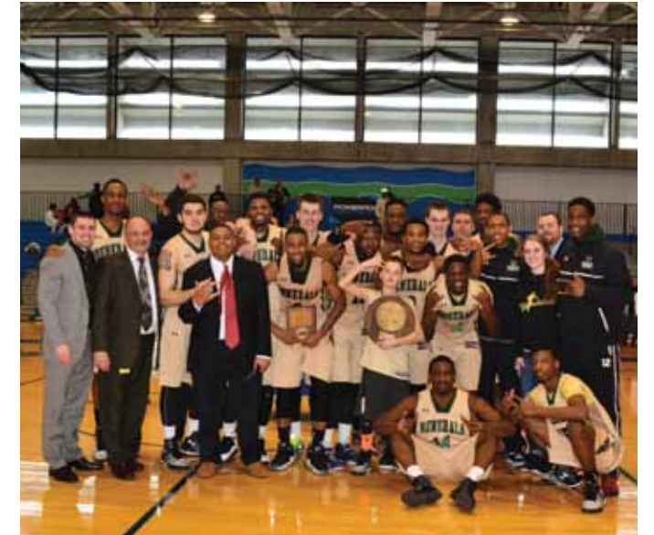
The Herkimer Generals men's basketball team won their third consecutive Region III Championship at Finger Lakes Community College in February. The team defeated Fulton-Montgomery 65-50 in the opening round, Finger Lakes 65-59 in the semis and Mohawk Valley in the championship 74-67, all in the matter of three days. The Generals have knocked the Hawks out of the Region III Tournament each of the past three seasons and finished fourth, seventh and third at nationals during that time.